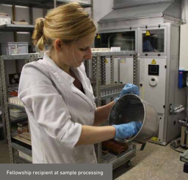
Fellowship recipient at sample processing