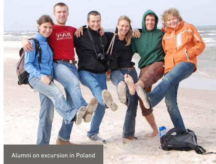
Alumni on excursion in Poland

During the fellowship practical solutions for current environmental issues are developed. After their stay in Germany the alumni are well qualified to tackle these issues in their home countries thus assuring efficient knowledge transfer. Working closely together in an international context helps to breakdown existing barriers. The acquired contacts will create a strong network of highly committed environmental experts.