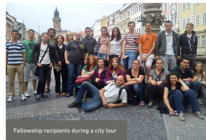
Fellowship recipients during a city tour